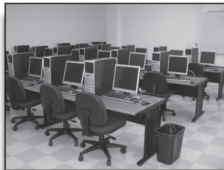
Technology fee dollars help pay for projects like new computer labs, which help promote student learning.