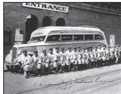
The Pittsburgh Crawfords pose in front of their team bus at Greenlee Field in Pittsburgh in 1935. The Crawfords were one of the few Negro league teams of the 1930s to own their own home field. For many years, their archrivals were the Homestead Grays, another Pittsburgh-based team.