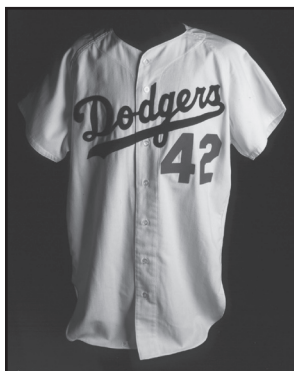
Jackie Robinson's No. 42 Brooklyn Dodgers jersey from 1956, the final year of his career

Baseball is one of America's major sports, and it has long reflected the complicated and painful history of race in the United States. Pride and Passion: The African American Baseball